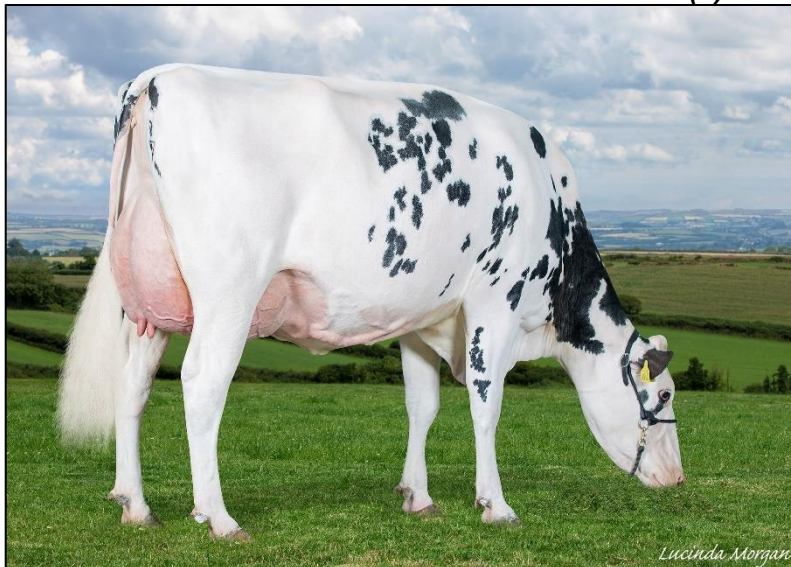
Sister to Dam 'Willsbro Granite Amber 112 EX92(3) LP60'