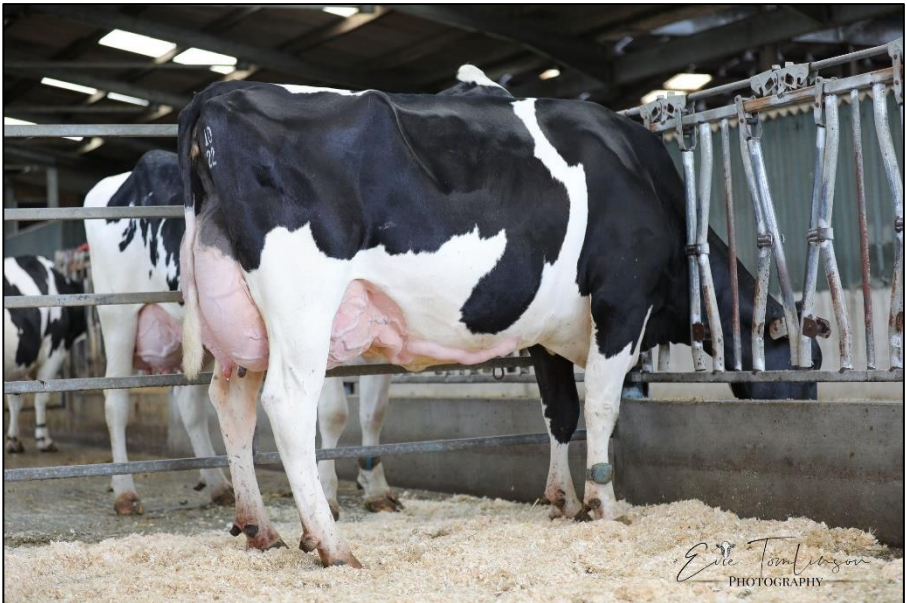
Dam 'Willsbro Perseus Lila Z 365 VG85 SP'

Sire Dg Nh Arrow By: Woodcrest King Doc Dam Willsbro Perseus Lila Z 365 VG85 SP By: Westcoast Perseus 1st 10513 4.25 3.32 305 2nd 13295 4.26 3.20 301 3rd 13550 4.28 3.26 305 G.Dam Willsbro Commander Lila Z 182 ET EX91(2) LP70 SP 22* By: Larcrest Commander 1st 12452 3.64 3.13 305 2nd 16174 3.40 3.30 305 3rd 18551 3.74 3.12 305 4th 14569 3.56 3.17 305 3.Dam Willsbro Meridan Lila Z 110 ET VG87 11* By: Sully Hart Meridian 4.Dam Willsbro Mom Sho Lila Z ET VG85 4* By: Long-Langs Oman Oman 5.Dam Willsbro Sho Lila Z ET EX93 SP 6* By: Picston Shottle 6.Dam Acecroft Goldwyn Lila Z VG87 SP 73* By: Braedale Goldwyn 7.Dam Lylehaven Lila Z PI EX94(2) By: Regancrest Elton Durham 8.Dam Lylehaven Form Laura PI ET EX94(2) By: Shen-Val Nv Lm Formation 9.Dam Thiersant Lili Starbuck BRC EX94 By: Hanoverhill Starbuck 10.Dam Ivyhall Astro Jet Ronnie PI VG86