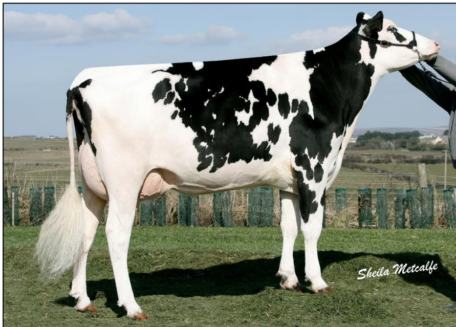
3.Dam 'Riverdane Rose ET EX90 LP80 SP 41*

By: Woodcrest King Doc By: Morningview Muscantine 305 305 305 By: Willsbro Lingo 269 305 305 297 By: Picston Shottle By: Stbvq Rubens By: Startmore Rudolph By: Kinglea Leader By: To-Mar Blackstar By: Hanover-Hill Triple Threat-Red By: Life-O-Riley Marquis