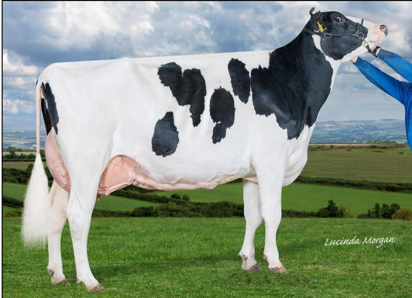
Full Sister to G.Dam 'Willsbro Deman Ashlyn 68 ET EX92(2) LP70 SP 10**'

By: Kings-Ransom G Dylan By: Stantons Chief 305 305 305 By: Edg Saturn Sender 8136 305 210 By: Edg Deman Et Hcdo By: Regancrest-Gv S Bradnick By: Ms Atlees Sht Aftershock By: Braedale Goldwyn By: Regancrest Elton Durham By: Marcrest Encore By: Dreamstreet Odyssey