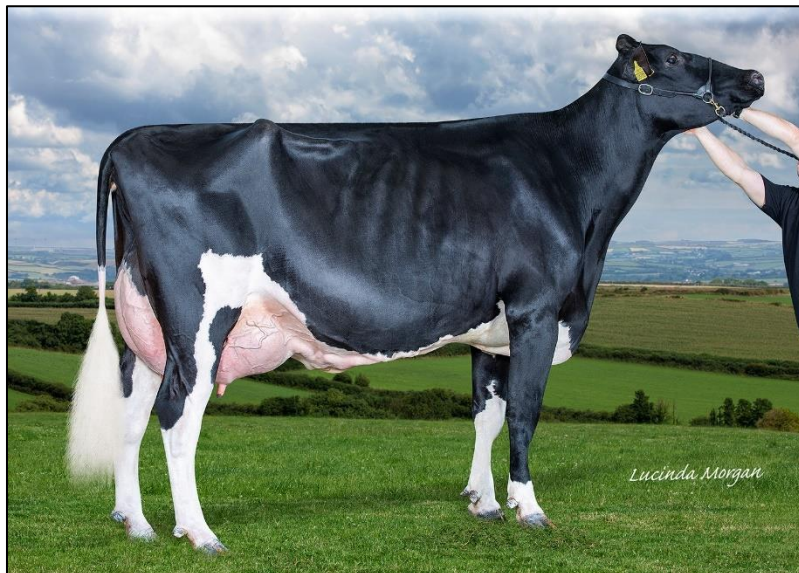
Sister to G.Dam 'Willsbro Abbott Aderyn EX93 LP60 11*'

By: Sandy-Valley Kr Excalibur By: Claynook Miami 305 305 By: View-Home Cardinals 305 303 305 By: Seagull-Bay Supersire By: Charlesdale Superstition By: Braedale Goldwyn By: Regancrest Elton Durham By: A Ronnybrook Prelude By: Meadolake Jubilant By: Life-O-Riley Marquis By: Donken Ideal Reflection Brutus